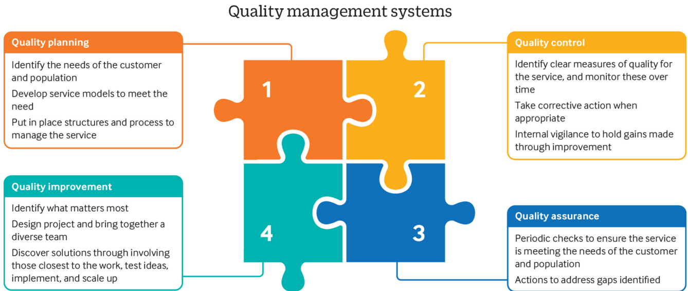
Fig 1 | The four aspects of a quality management system: planning, control, assurance, and improvement

Together, improvement, assurance, planning and control form the quality management system (fig 1).